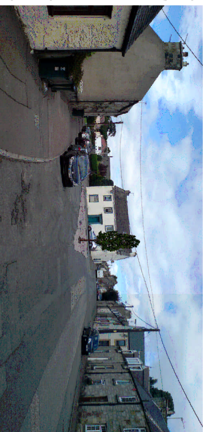
Proposed view up Westerloan