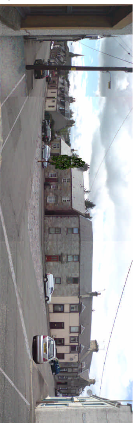
Proposed View from top of Westerloan down hill