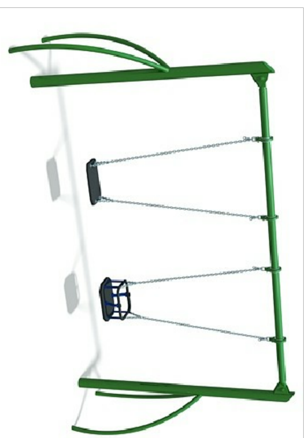
Young Swing - Cradle Seats