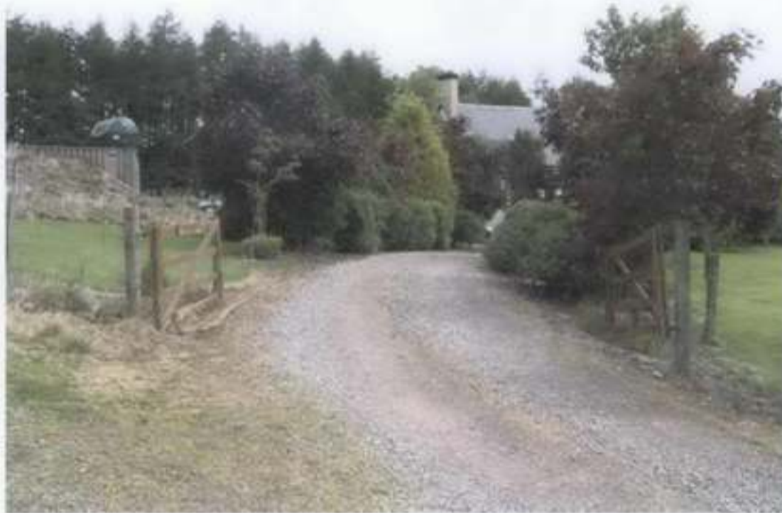
View from Approach Road