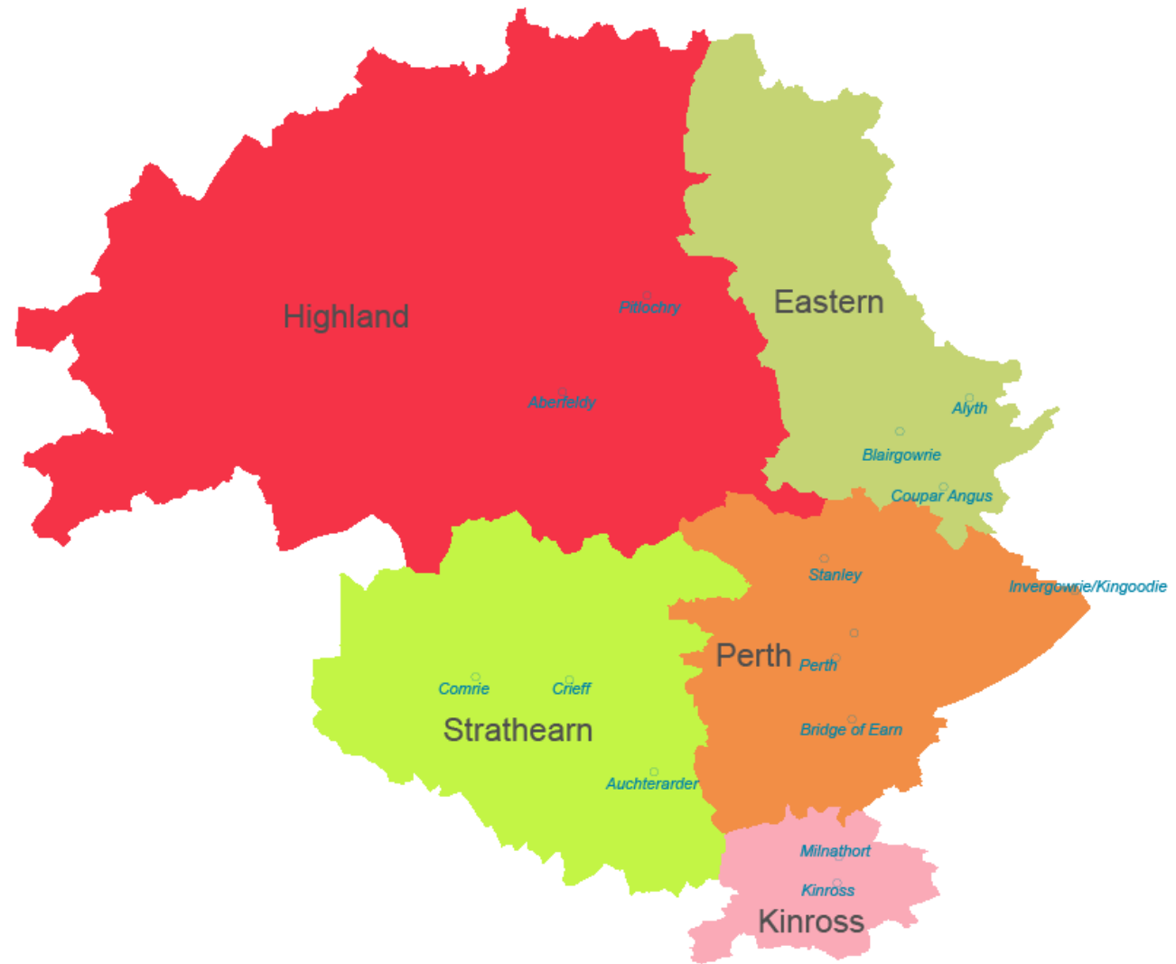
Figure 1: Planning Areas in Perth and Kinross

© Crown copyright. All rights reserved. Perth & Kinross Council. Licence number 100013289. 2008.