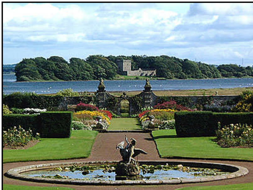
Kinross House Gardens and Loch Leven