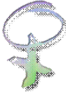
Women's Rape and Sexual Abuse Center