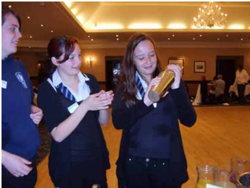
A trio from Perth Academy design their own mocktail