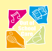
Drawing by Charlie, aged 9