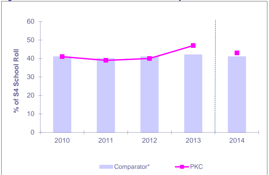
Figure 1: 5 or more awards at SCQF Level 5 or better by the end of S4

* The 2010 – 2013 comparator is an average of results from schools in Aberdeenshire, Argyll and Bute, Highland, Scottish Borders and Stirling Councils. This is not available for 2014 due to changes in the authorities that form the consortium for analysis, and the development of new National measures. The 2014 comparator is a 'virtual' authority comprising the results of pupils of the same gender, stage and deprivation level from across Scotland, and is considered a more robust method of comparison.