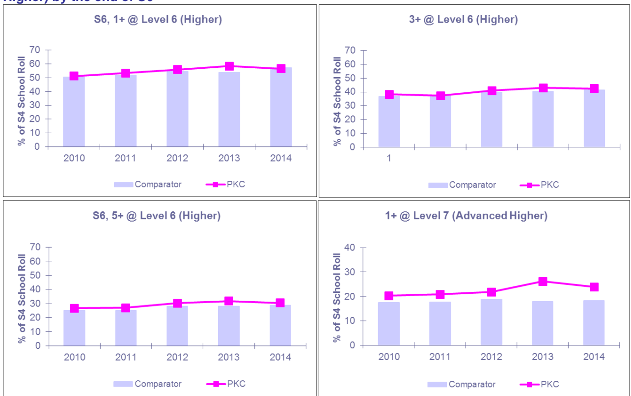
Figure 3: 1, 3 and 5 awards or better at SCQF Level 6 (Higher) and SCQF Level 7 (Advanced Higher) by the end of S6