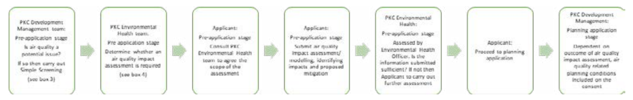
Figure 3: Process describing how air quality impacts will be considered when determining planning applications

For applications where an EIA is not applicable the next step is to determine if an air quality impact assessment report is required; in which case you will be referred to the Perth and Kinross Council Environmental Health Team