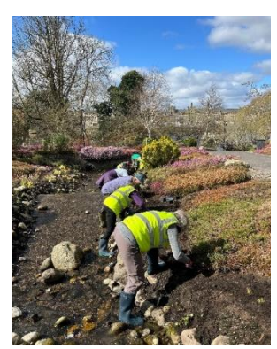
Beautiful Perth volunteers restoring riparian habitat

Application of the fund demonstrates the Council's commitment shown in declaring a climate emergency and the signing of the Edinburgh Declaration and provided an opportunity to deliver on the PK Offer both through community involvement and in making Perth and Kinross a better, greener place.