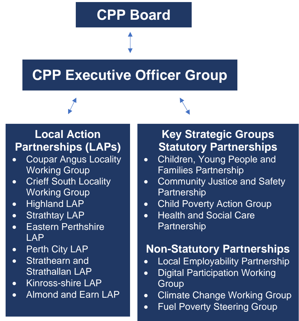
Figure 1: Community Planning Partnership Structure

Within the Community Justice (Scotland) Act 2016, Community Justice Partnerships (CJPs) are answerable solely to the Statutory Partners own governance arrangements. However, within Perth and Kinross it is recognised that the Community Justice Partnership should be part of the local community planning process, and therefore the Community Justice and Safety Partnership also reports to the CPP within Perth and Kinross.