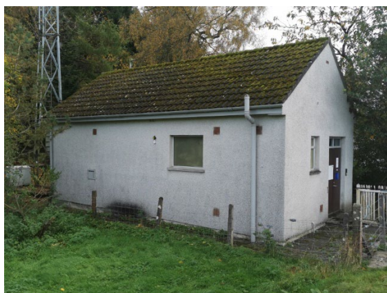
Telephone exchange Building – North Facing

By defining the telephone exchange as a building which is comparable to that of a traditional cottage, the proposed site can be deemed to be infill between the aforementioned and the existing dwelling at Cottage of Clunie.