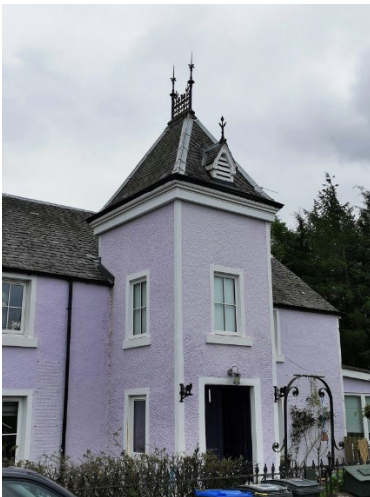
Frontage at Cottage of Clunie

Improvements are proposed to the existing onsite services infrastructure provision (septic tank, drainage etc.), and will harness sustainable design principles maximising the use of renewable energy source including Air Source Heating & Solar Roof Panels.