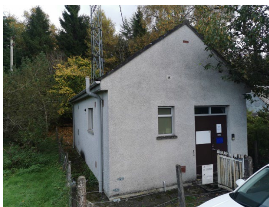
Telephone Exchange - West Facing