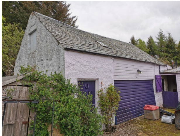
Existing Garage Outbuilding as viewed from Northwest

Project – Redevelopment of Existing Garage/Outbuilding to form Ancillary Dwelling House