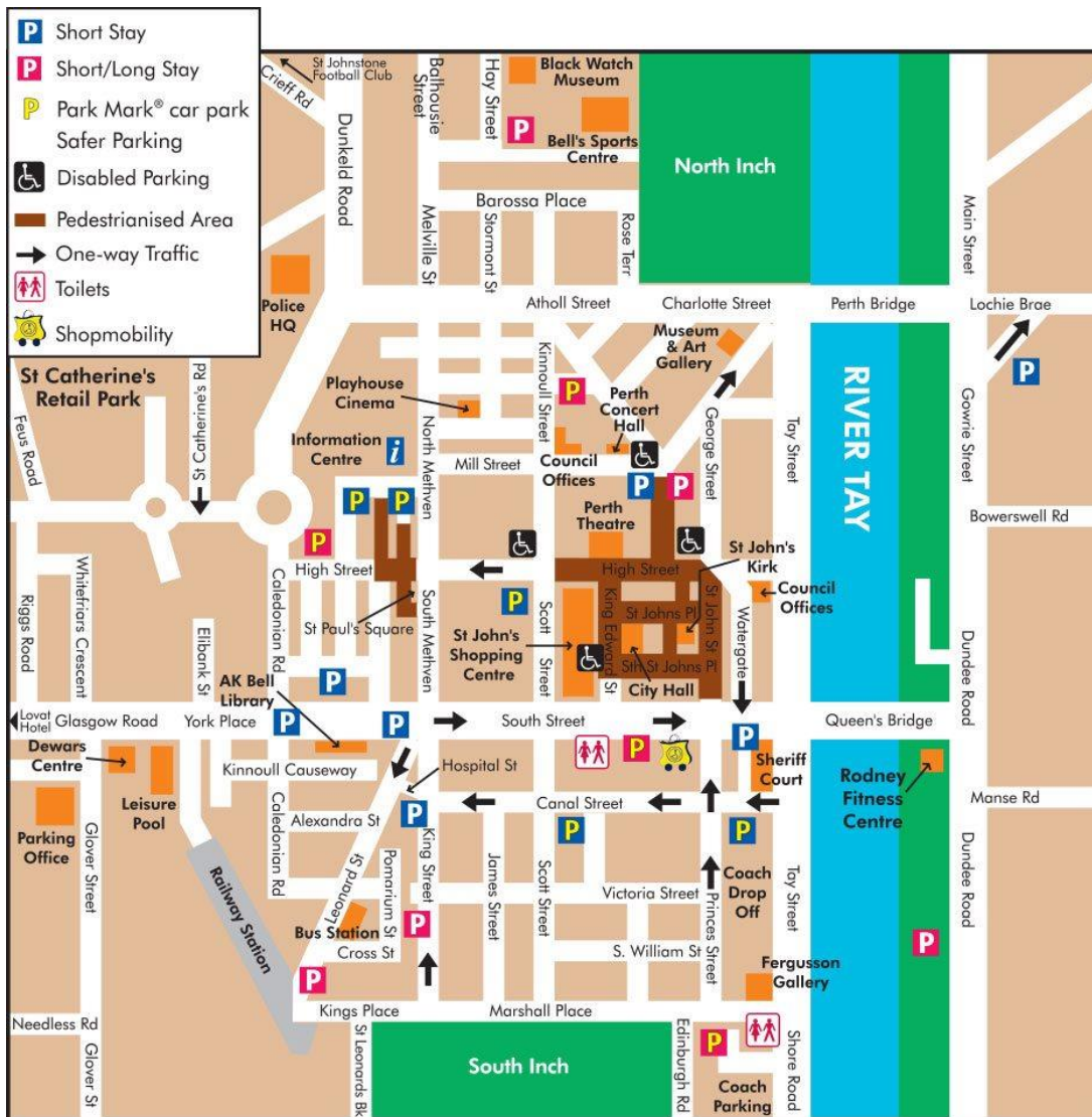
Perth City Centre